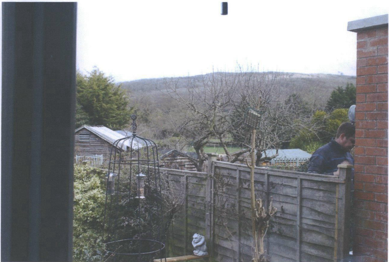
Figure 2 View from my kitchen window showing how fence height reduced by raised patio