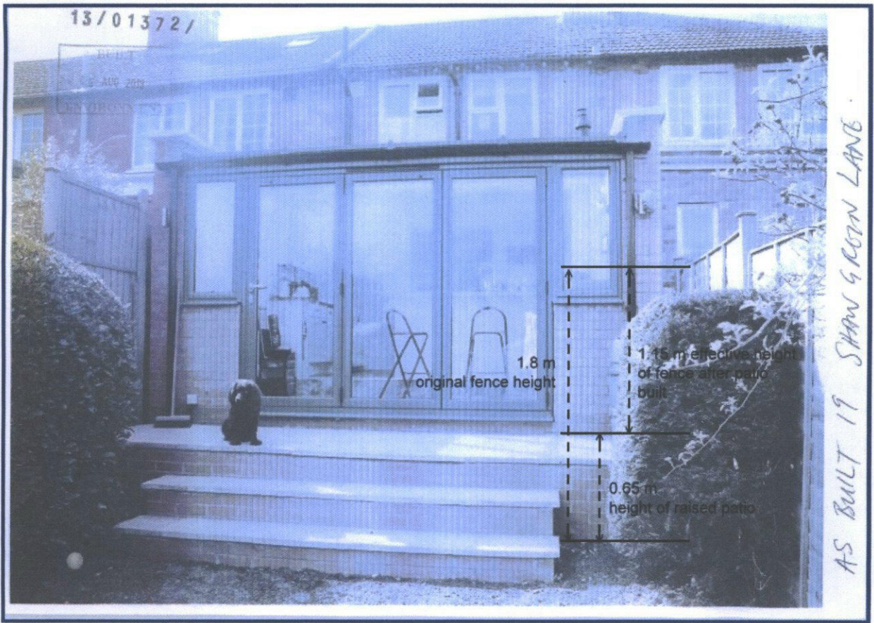
Figure 1 Effective height of fence with raised patio